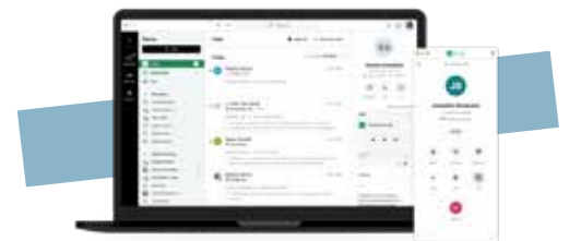
Fig 1: GoTo Connect Desktop App (Phone)

Enterprise-grade security and compliance with standards like SOC 2 Type II and GDPR keep your data safe.